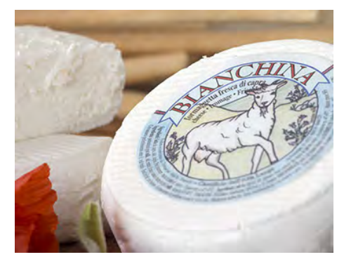
Alta Langa Bianchina

Milk Type: Cow, Sheep, Goat Region of Origin: Piemonte This soft-ripened, yellow cheese is made with pasteurized milk, and has a fine, compact texture and flavors of hay, milk and a light animal note. Item #IT1702 - 6/8 oz.