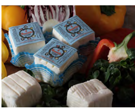
Alta Langa Il Nocciolo Milk Type: Cow, Sheep, Goat Region of Origin: Piemonte A soft-ripened, cube made with pasteurized milk. Aged for only 24 hours, this creamy cheese has a light acid note with the sweetness of melted butter. Item #IT1736 - 8/3.5 oz.