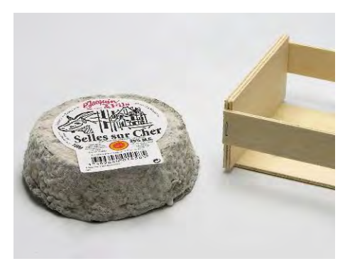
Jacquin Selles Sur Cher in Wood Box

Milk Type: Goat Region of Origin: Berry, Loire Valley Item #37438 – 1/1 kg.