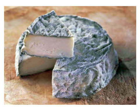
Jacquin Rond du Cher Milk Type: Goat

Region of Origin: Berry, Loire Valley As it ages, the surface area dries out and the interior becomes creamy and complex with notes of hay. A fresh cheese coated in vegetable ash.