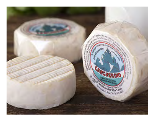
Alta Langa Langherino

Milk Type: Cow, Sheep Region of Origin: Piemonte A soft-ripened cheese made with pasteurized milk. With a tender, smooth mouthfeel when young, the cheese becomes intense and creamy with age.