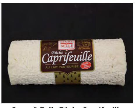
Sevre & Belle Bûche Caprifeuille

Milk Type: Goat Region of Origin: Charantes-Poitou Depending on age, it can be slightly runny along the edge or cakey and dense all the way through. Item #1255 - 6/200 g.