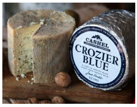
Cashel Crozier Blue

Milk Type: Sheep Region of Origin: Tipperary A vegetarian-friendly cheese with a rich, wellrounded flavor. It is gently salty with a distinctly rich creamy texture, offset by a touch of spice.