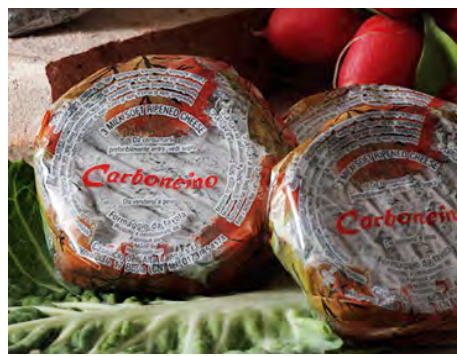
Alta Langa Carboncino Milk Type: Cow, Goat, Sheep Region of Origin: Piemonte A soft-ripened, washed rind cheese coated in vegetable ash. Made with pasteurized milk, it has flavors of warm milk with a bitter vegetable note. Item #IT1798 – 8/8 oz.