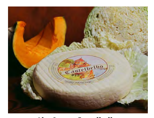
Alta Langa Castelbelbo Milk Type: Cow, Goat, Sheep Region of Origin: Piemonte A soft-ripened cheese with a compact, wet texture. Made with pasteurized cow, sheep and goat's milk, this cheese is best served at room temperature. Item #IT1746 - 1/3 lb.