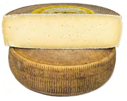
Toma Alpeggio di Roberto

Region of Origin: Lombardia A raw milk cheese with a rich flavor highlighting animal and grassy notes. Wheel: Item #55206 - 1/8 lb. Quarter: Item #55205 - 1/2 lb.