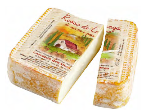
Alta Langa Rosso di Langa

Milk Type: Cow, Sheep Region of Origin: Piemonte A soft-ripened, washed rind cheese made with pasteurized cow and sheep's milk. Known for its red-orange hue, this sweet, creamy cheese has flavors of boiled milk and fresh grass.