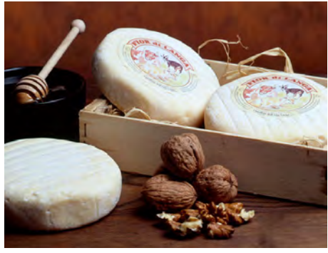
Alta Langa Fior di Langa Milk Type: Cow, Sheep, Goat Region of Origin: Piemonte This soft-ripened cheese is made with pasteurized cow, sheep and goat's milk. Fior di Langa has a wet texture with flavors of fresh milk and fresh grass. Item #IT1776 - 6/10 oz.