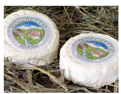
Alta Langa Rocchetta

Milk Type: Cow, Sheep Region of Origin: Piemonte A square, soft-ripened cheese made with pasteurized milk. Known for its intense scent, Bosina is both delicate and smooth on the palate. Item #61701 - 8/400 g.