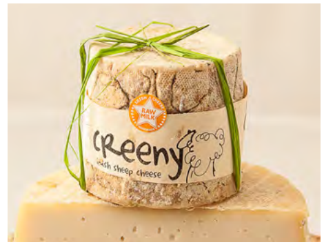
Corleggy Creeny Milk Type: Sheep Region of Origin: Cavan Creeny is a hard cheese made with raw sheep's milk. Item #45576 – 1/13 oz.