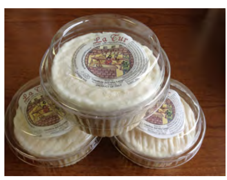
Alta Langa La Tur Cups Milk Type: Cow Sheep, Goat Region of Origin: Piemonte La Tur is a hand-processed, soft-ripened cheese with a light, creamy texture. Made of three milks, this cheese has both sweet and acidic notes. Item #IT1721 - 6/200 g.