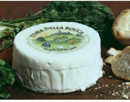
Alta Langa Toma Della Rocca

Milk Type: Cow, Goat, Sheep Region of Origin: Piemonte A soft-ripened cheese made with pasteurized cow, sheep and goat's milk. Made to look like a delicious cake, this cheese has a light, soft texture and tastes of fresh cream.