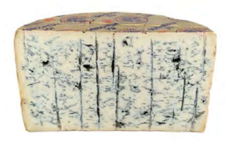
Gorgonzola DOP Piccante Milk Type: Cow Region of Origin: Lombardia, Piemonte Aged 300 days (three times longer than normal!), it has a compact texture, intense marbling, and an assertive, distinct flavor. Item #49403 – 1/10 lb.