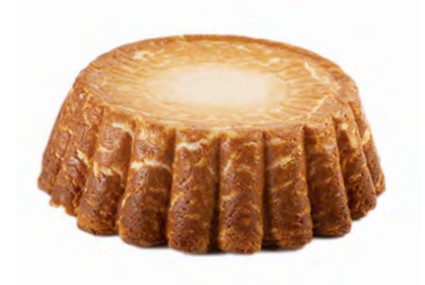
Dolce Ricotta Almond Milk Type: Cow, Water Buffalo Region of Origin: Puglia Item #51703 – 1/4 lb.

The cheese that thinks it's cake! Each torte is made from fresh Italian Ricotta that has been blended with preimum ingredients and baked to perfection. Lightly sweetened with a fluffy texture, each torte is easy to slice and serve.