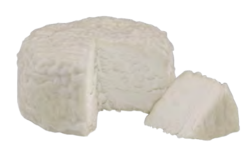
Remond Frères Cabécou 2-Pack Milk Type: Goat Region of Origin: Penne, Midi-Pyrénées region Item #78773 – 6/140 g.