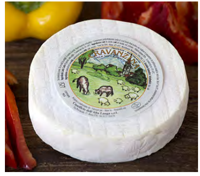
Alta Langa Cravanzina Milk Type: Cow, Sheep Region of Origin: Piemonte A tender, soft cheese made with pasteurized milk. With its sweet and smooth texture, this cheese has flavors of boiled milk and hay. Item #IT1770B - 10/8.8 oz.