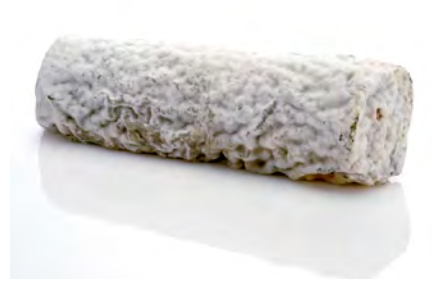
Jacquin Sainte Maure Ash

Milk Type: Goat Region of Origin: Berry, Loire Valley This log-shaped cheese is distinguished by a reed piercing through the center. It is extremely goaty and not for the faint of heart.