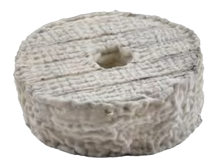
Remond Frères Rouelle Ash Milk Type: Goat Region of Origin: Penne, Midi-Pyrénées region Item #78770 – 6/250 g.

Under the line Remond Frères Fromagerie, brothers Julien and Benjamin reformulated their parents' famous geotrichum goat cheeses for the U.S. market. We believe the result is one of the finest lines of goat cheese on earth.