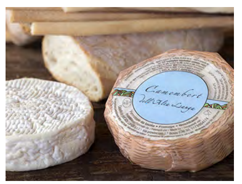
Camembert dell'Alta Langa

Due to the steep slopes of the surrounding mountains, commericialization of the production is near imporrible and thus the small herd of goats, sheep, and cows are untainted by the outside. Today, the "tradition of our grandparents" is evident through the high quality craftsmanship of these artisanal cheeses.