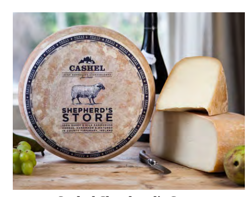
Cashel Shepherd's Store

Milk Type: Sheep Region of Origin: Tipperary A semi-hard cheese with a creamy texture. Aged for a minimum of six months, this is known for being a traditional farmhouse cheese.