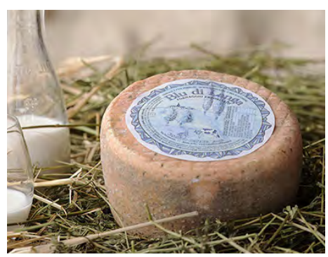
Alta Langa Blu di Langa

Milk Type: Goat Region of Origin: Piemonte This fresh, soft cheese is made with pasteurized goat's milk. Bianchina is acidic with flavors of yogurt and fresh grass. Item #1892 - 4/250 g.