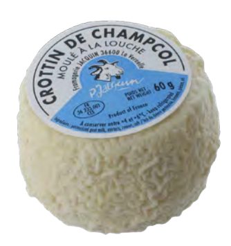
Jacquin Crottin de Champcol

Milk Type: Cow Region of Origin: Berry, Loire Valley Item #31529 - 6/250 g.