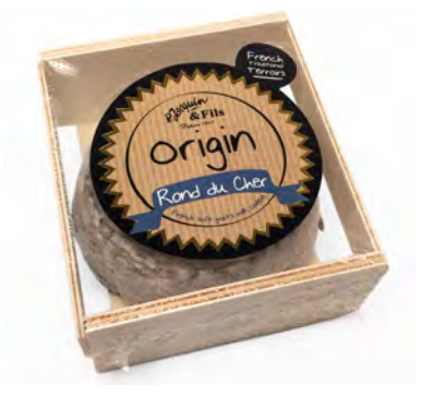
Jacquin Origin Rond du Cher in Wood Box

Milk Type: Goat Region of Origin: Berry, Loire Valley Ash ripened goat cheese with upfront notes of lemon and hay with a slightly barnyardy finish. Item #36343 - 6/150 g.