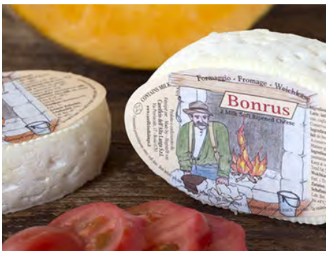
Alta Langa Bonrus

Milk Type: Cow, Sheep Region of Origin: Piemonte A soft-ripened oval cheese made with pasteurized milk. This cheese ripens for two weeks, giving it flavors of boiled milk and dried fruit.