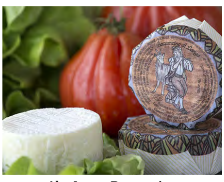
Alta Langa Bocconcino

Milk Type: Goat Region of Origin: Piemonte A soft-ripened cheese made with pasteurized goat's milk. With light, pungent flavors and aromas of herbs, it's best served when warmed on the grill.