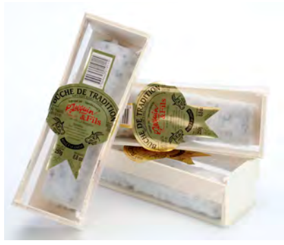
Jacquin Sainte Maure Ash in Wood Box

Milk Type: Goat Region of Origin: Berry, Loire Valley Ash ripened goat cheese with upfront notes of lemon and hay with a slightly barnyardy finish. Item #36343 - 6/150 g.