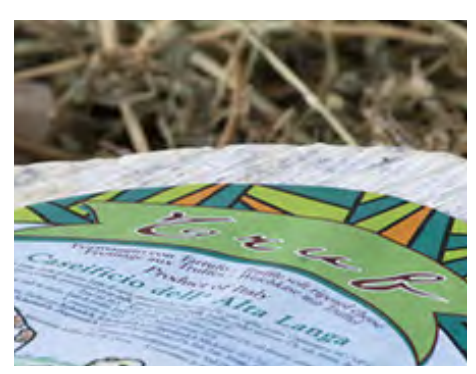
Alta Langa Truf

Milk Type: Cow, Goat, Sheep Region of Origin: Piemonte Truf 3 Latti is a soft-ripened cheese made with pasteurized cow, sheep and goat's milk. Flavored with chunks of black truffles, this cheese tastes of fresh milk, cream and fresh grass.