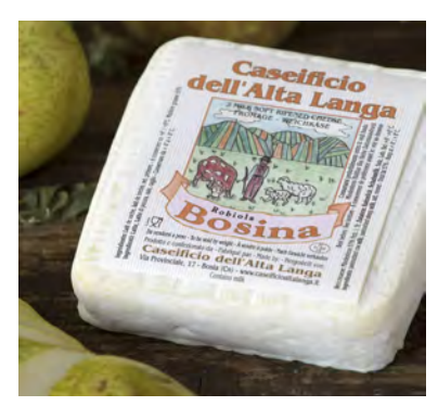
Alta Langa Robiola Bosina

Milk Type: Cow, Sheep Region of Origin: Piemonte A square, soft-ripened cheese made with pasteurized milk. Known for its intense scent, Bosina is both delicate and smooth on the palate. Item #61701 - 8/400 g.