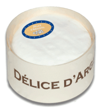
Délice d'Argental Mini

Milk Type: Cow Region of Origin: Burgundy This soft ripened triple-cream is made from cow's milk with crème fraîche added. The texture is unctuous and creamy with a milky, delicate flavor.