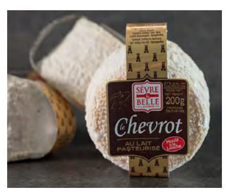
Sevre & Belle Le Chevrot

Milk Type: Goat Region of Origin: Charantes-Poitou Depending on age, it can be slightly runny along the edge or cakey and dense all the way through. Item #1255 - 6/200 g.