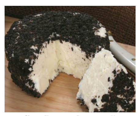
Délice d'Argental aux Truffes

Traditional: Item #11257 - 6/100 g. Bio (Organic): Item: #10807 - 6/200 g.