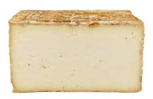
Salva Cremasco DOP

Milk Type: Cow Region of Origin: Lombardia Under the natural rind, the paste is aromatic and bright, changing from creamy to crumbly the closer you get to the center.