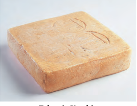
Taleggio Vecchio Milk Type: Cow Region of Origin: Lombardia Creamy paste with a red, spreadable rind. Hidden, full-bodied flavor. Perfect example of the craft of cheese making. Item #54043 – 1/5 lb.