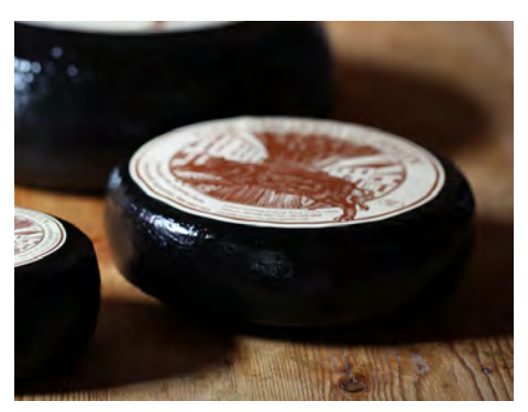
Oak Smoked Gubbeen

Item #45352 - 1/1.25 kg. Item #45322 - 12/12 oz.