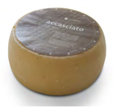
Accasciato Milk Type: Buffalo, Cow Region of Origin: Campania This semi-soft aged cheese is sweet and aromatic. Its creamy and soft inside is protected by a firm, opaque rind. Item #46143 – 4/1.8 kg.