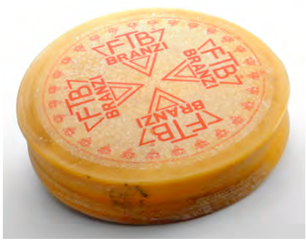
Branzi Milk Type: Cow Region of Origin: Lombardia An Alpine-style cheese, Branzi has a nutty flavor and is known for its melting capabilities. Item #46393 – 1/16 lb.