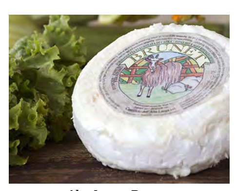
Alta Langa Brunet

Milk Type: Goat Region of Origin: Piemonte A pasteurized, soft-ripened cheese. Reminiscent of Robiola, this cheese—with its aromas of bread and