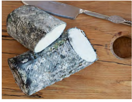
St. Tola Goat Log with Ash Milk Type: Goat Region of Origin: Clare St. Tola Ash is a pasteurized goat's milk log covered in ash. This cheese has a fresh and creamy taste. Item #45561 – 1/1 kg.