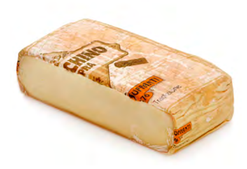
Stracchino di Capra Milk Type: Goat Region of Origin: Lombardia Similar to Taleggio, which used to be called Stracchino, this cheese is made exclusively with full-fat, raw goats' milk. Item #49343 – 1/4.75 lb.