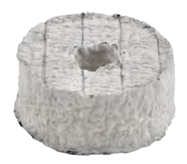
Remond Frères Petite Rouelle Ash Milk Type: Goat Region of Origin: Penne, Midi-Pyrénées region Item #78775 – 6/155 g.