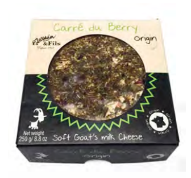
Jacquin Origin Carré du Berry in Box

Milk Type: Goat Region of Origin: Berry, Loire Valley Item #36653 – 5/250 g.