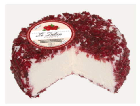
Délice d'Argental aux Cranberry

Milk Type: Cow Region of Origin: Burgundy Truffles and cream are a delicous addition to Delice d'Argental. Bold umami notes balance out the rich, créme fraîche tang of this cheese. Item #11250 - 6/110 g.