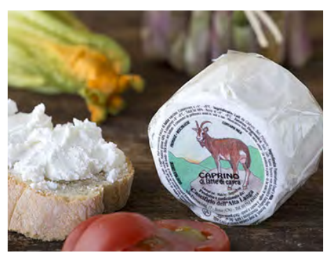
Alta Langa Caprino di Latte di Cabra Milk Type: Goat Region of Origin: Piemonte Caprino is a fresh and delicate cheese made with pasteurized goat's milk. This white, rindless cheese has a clean taste with creamy and acidic notes. Item #IT1751 - 6/5 oz.