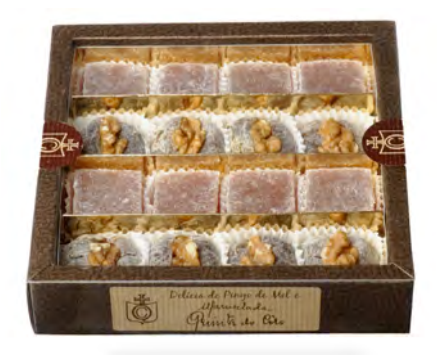
Quinta do Côro Port Fig, Walnut, & Quince Candies

Item #62878 - 6/320 g. Item #62881 - 1/5 kg.