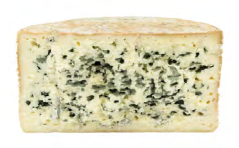
Erborinato di Pecora Milk Type: Sheep Region of Origin: Lazio, Bracciano Erborinati Di Pecora is a raw milk blue with strong and intense flavors. This cheese has a compact, yellow paste with holes and bluish marbling. Item #48700 – 1/3 lb.