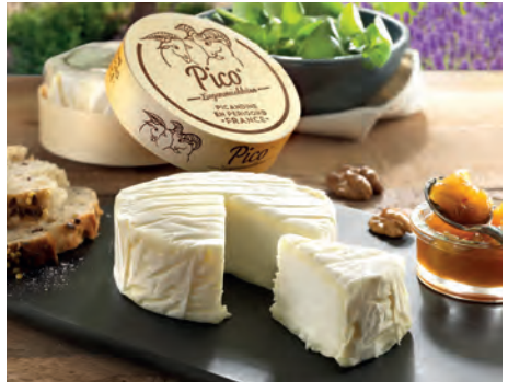
Pico Picandine Milk Type: Goat Region of Origin: Perigord A chalky cheese with an oozing creamline. Its flavor is lactic and grassy-sweet with a hint of salt and scant barnyard notes. Item #1298 - 6/100 g.