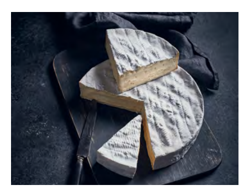
Tremblaye Brie Fermier Milk Type: Cow Region of Origin: Ile de France Full flavored with notes of mushroom, this organic brie is the closest to a French AOC version available in the US. Item #37233 – 2/1 kg.